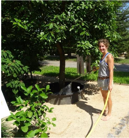
Eine Arbeitskollegin beim Wässern der Kübelpflanzen