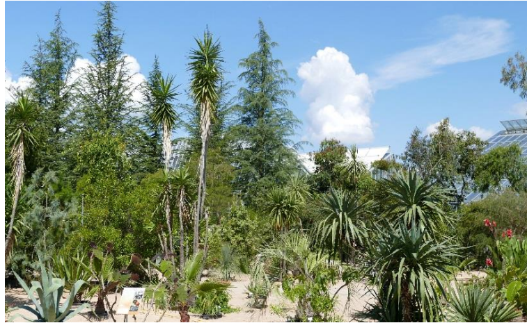
Die Sandfläche mit den tropischen, subtropischen und mediterranen Kübelpflanzen

The second place in the Botanical Garden where I worked was the tropical greenhouse. Here I also collected organic material and helped with pruning. I also helped in the nursery of this section to fertilize.