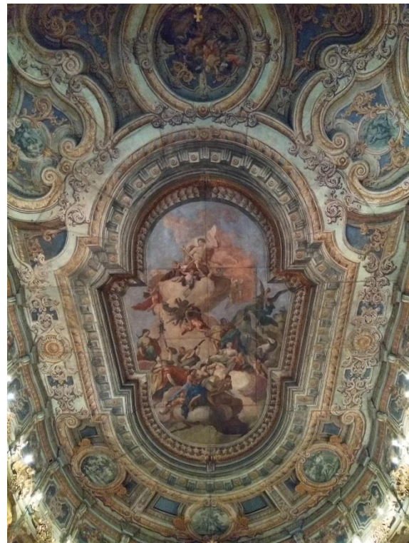
Innenansichten des Markgräflichen Opernhaus Bayreuth, eine UNESCO Weltkulturerbestätte