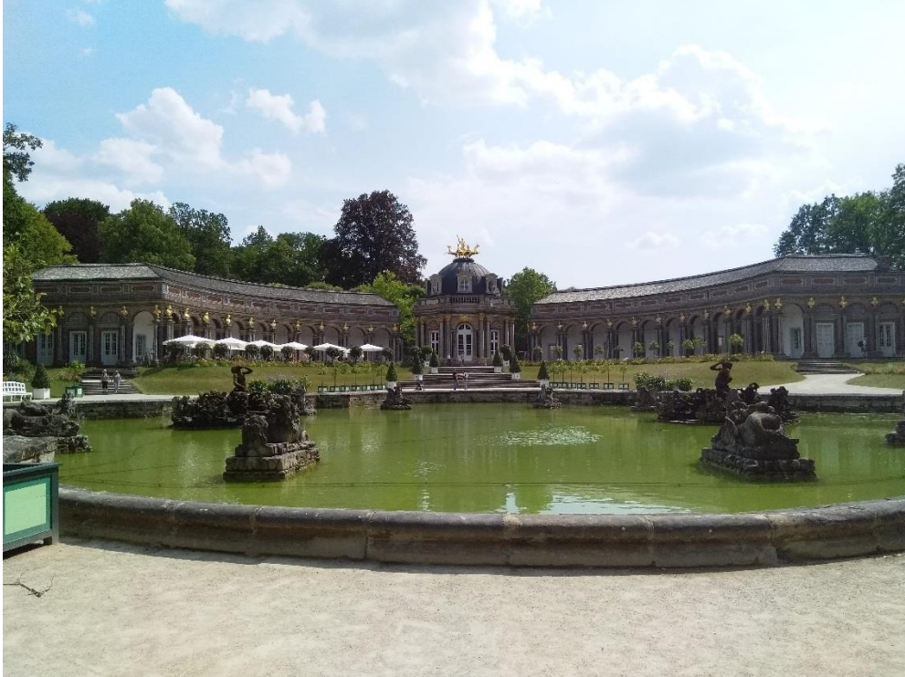
Orangerie mit Sonnentempel, Eremitage Bayreuth, eine barocke Parkanlage

After finishing my exchange time I was able to travel a little through Germany, Belgium and Holland. I knew the cities of München, Nürnberg and Berlin. In Munich I visited the city's Botanical Garden. It was also impressive for me to walk through those gardens. In Nürnberg I attended a music festival (whose name I don't remember) and from there I travelled to Breda, in the Netherlands, to meet a friend who works as a volunteer in the Kalmthout Arboretum, in Belgium. I stayed at her house in the village of Essen, very close to the border between Belgium and Netherlands. On the last day of this part of the trip, I returned to Breda to board my bus to Berlin. I walked a few hours through Breda.