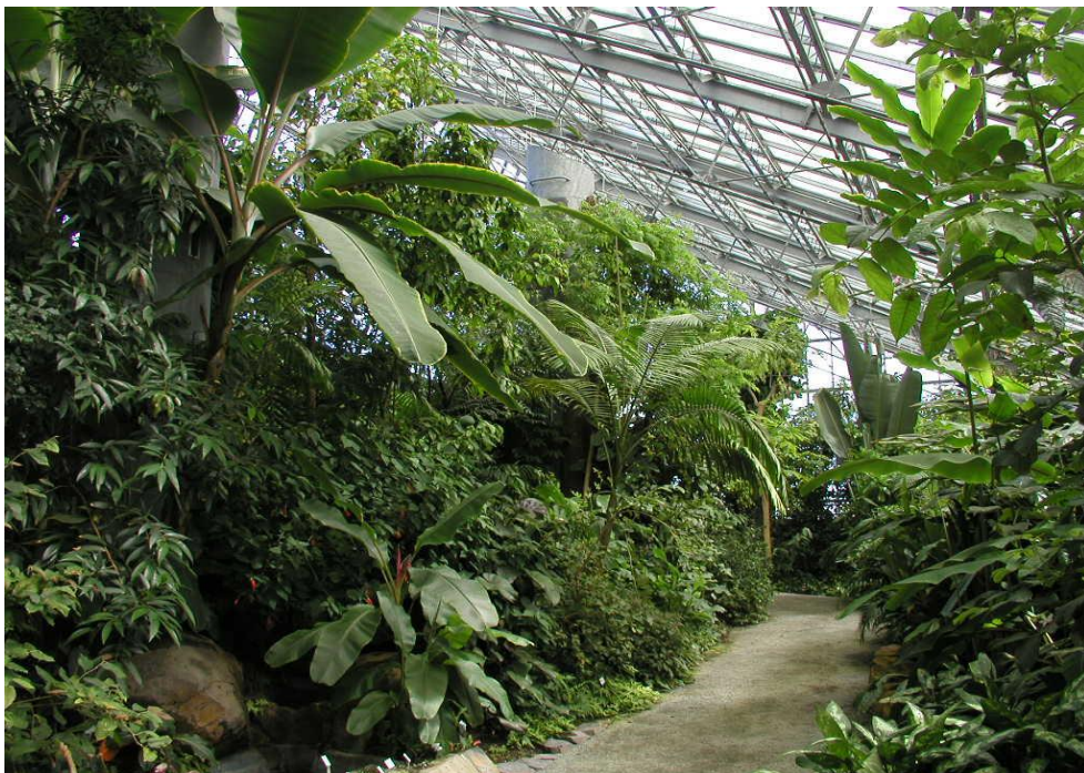
Blick ins Tropenhaus des Ökologisch-Botanischen Garten

The second place in the Botanical Garden where I worked was the tropical greenhouse. Here I also collected organic material and helped with pruning. I also helped in the nursery of this section to fertilize.