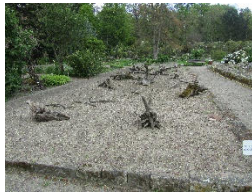
Landscaping with Succulents