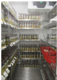
Cold storage of seed